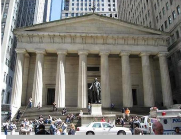
Federal hall (联邦大厅)