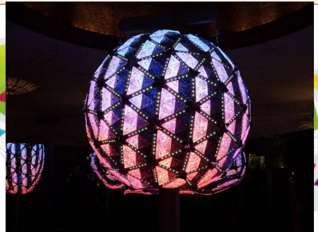
Times Square (时代广场)