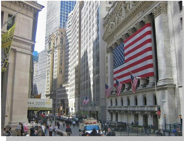
Wall Street (华尔街)