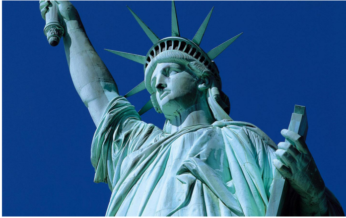
The Statue of Liberty