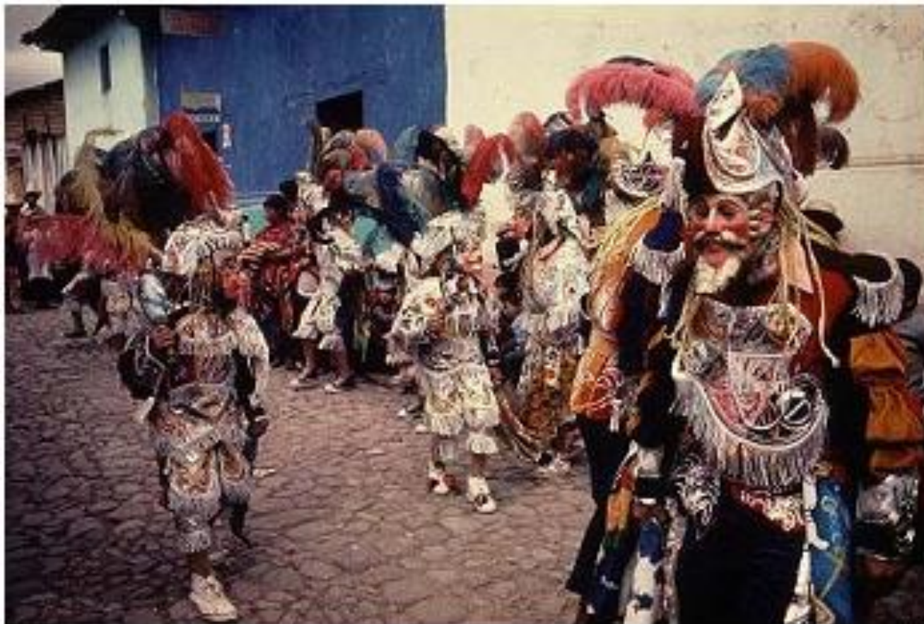
Christmas Festivities, Guatemala(危地马拉)