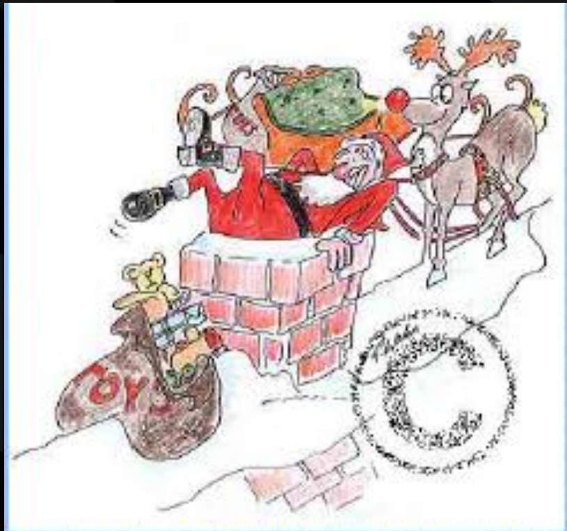
Santa Got Stuck in Chimney