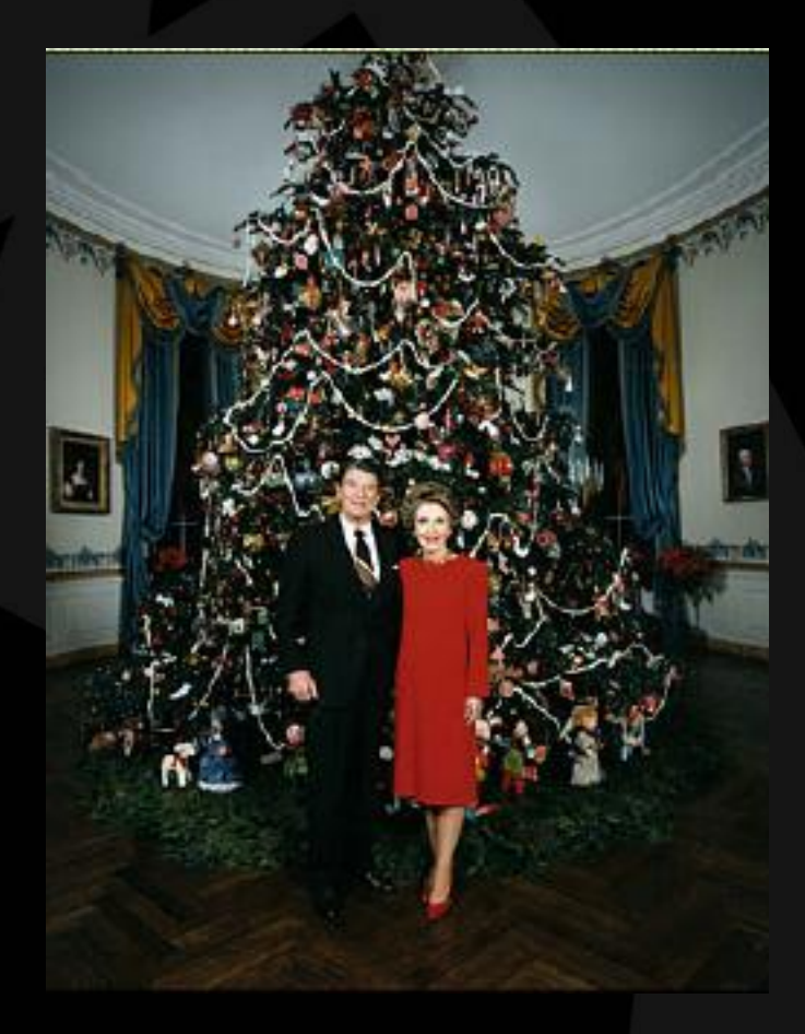
The 1986 Reagan tree