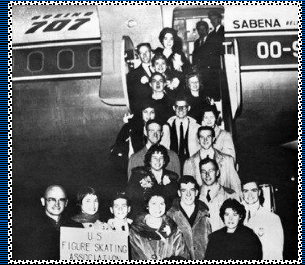
photo was taken of the team members as they stood on the steps of the Sabena Airlines 707 jet. The best of America's skaters beamed for the camera. Mostly young, they laughed and giggled, their eyes dancing with excitement. This was going to be the time of their lives.

They boarded the plane in New York City with high hopes. The 18 members of the United States figure skating team would fly to Brussels, Belgium. Then they were to go on to Prague, Czechoslovakia, for the world ice skating championships . A